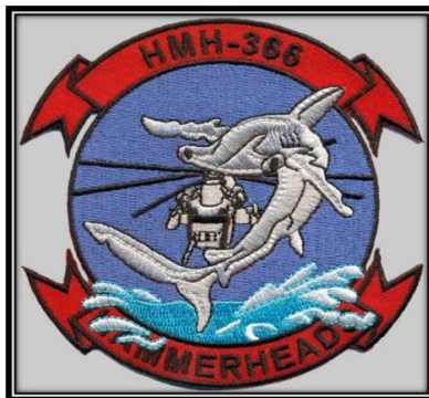
The Hammerheads ' squadron patch.

HMH-366 was selected as the Marine Corps’ seventh CH-53E squadron, because it was the only active duty HMH to have been previously decommissioned. The original squadron patch was modified to replace the CH-53D with a CH-53E, and the colors were changed to reflect those of the North Carolina State Flag to reflect the squadron’s new air station being MCAS New River in Jacksonville, NC.