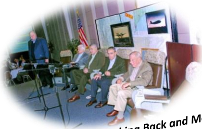
Aviation Connections: Looking Back and Moving Forward