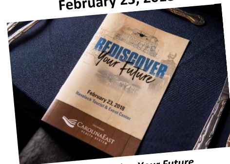
Rediscovering Your Future Featuring Eddie Ellis