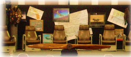
Aviation Heritage: Tradition Spurs Vision