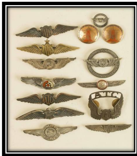
Various Air Transport Command pilot and aircrew wing insignia

Ferry Command (what later became known as the Air Transport Command, or ATC, as we'll discuss later in this column), wings insignia were different (and there were several variations) than the standard US Army Air Corps wings.