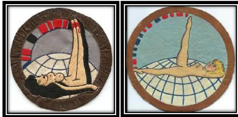
“Unauthorized (some might say, especially today, “rogue”) ATC Patches, circa 1944, using ladies to represent the compass depicted on the official ATC logo pictured above, page 6.

ports of embarkation. From there, the aircraft were flown to overseas destinations including war zones.”