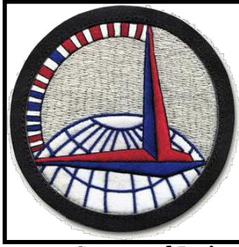
Air Transport Command Insignia, 1942