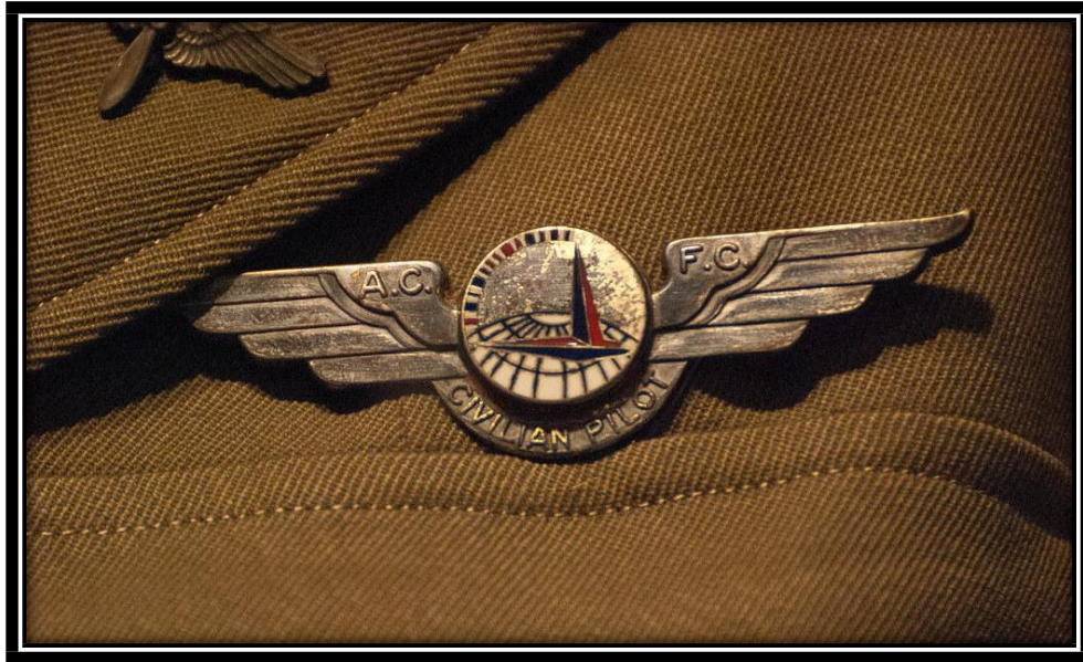
Air Transport Command Civilian Pilot Wings insignia/Air Corps Ferry Command

And ATC made use of both military and civilian pilots in accomplishing its mission as we'll see a little later in this column.