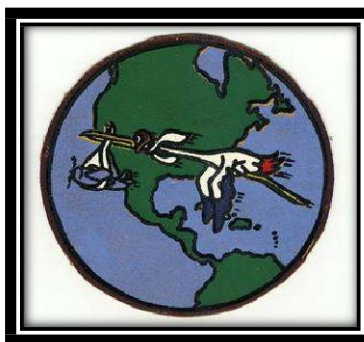
VRF-1 Air Ferry Squadron Patch

The above descriptions of what the Navy Ferry Command accomplished describe well what the AAF ATC—and Great Uncle Ray—also did. But ATC did it on a far grander scale than the US Navy.